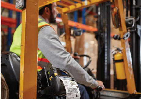
Warehouse and Logistics

Companies trust BarTender to improve worker productivity, meet regulatory compliance, and reduce costs associated with poor labeling practices. Now with the BarTender Mobile App, they can enjoy easy, fast and secure mobile printing of documents, barcode labels and RFID tags at their source of work.